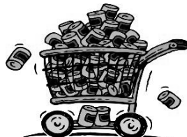
Salvation Army Drive

- The Ministry of the Diaconate will collect and/or other non-perishable food items. Please leave items in the grocery cart in the coat foyer.